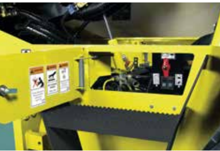
Tilting cabin for safe and easy maintenance and service