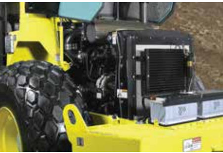
Accessible engine compartment and battery location