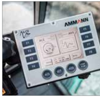
ACE - Ammann Compaction Expert