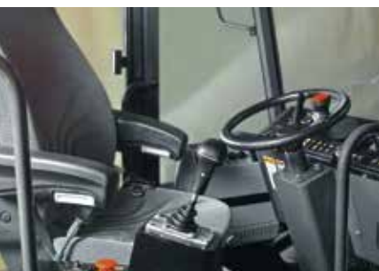
Integrated cockpit with rotating seat