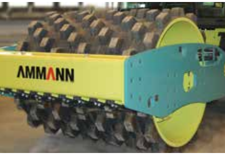
PD shell kit